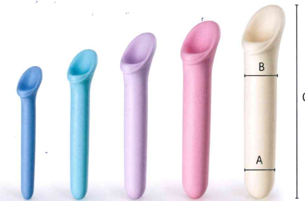
Size 1 (Light blue) Size 2 (Mint green) Size 3 (Purple) Size 4 (Pink) Size 5 (Beige)